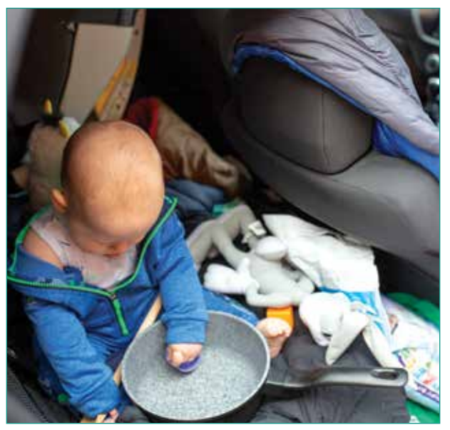
The back seat of the car now represents all the rooms in my home since we had to leave it. That's where Mum and I sleep; it's storage; for our household contents that we managed to bring with us; it's my change table; my playpen; it's food storage and prep; and it's where we get washed. The nice people from SPLaSh help with food, showers and washing our clothes. The family worker talks to Mum about the future and has found a great playgroup for me to join. I miss my cot and all my toys.

It's stories like these and the generous support we receive from our wonderful community that give us the strength and determination to keep on going.